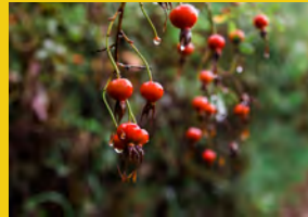
A rose hip