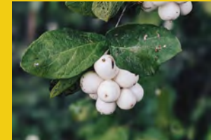
A white berry