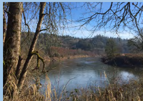
A river, lake, or stream