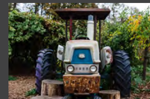
Something a farmer uses to grow food