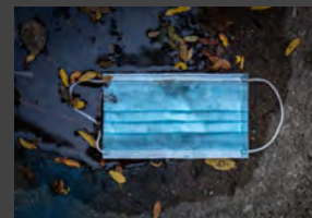
A piece of litter pollution (put it in its place!)