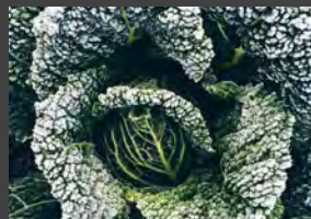
A winter farm crop